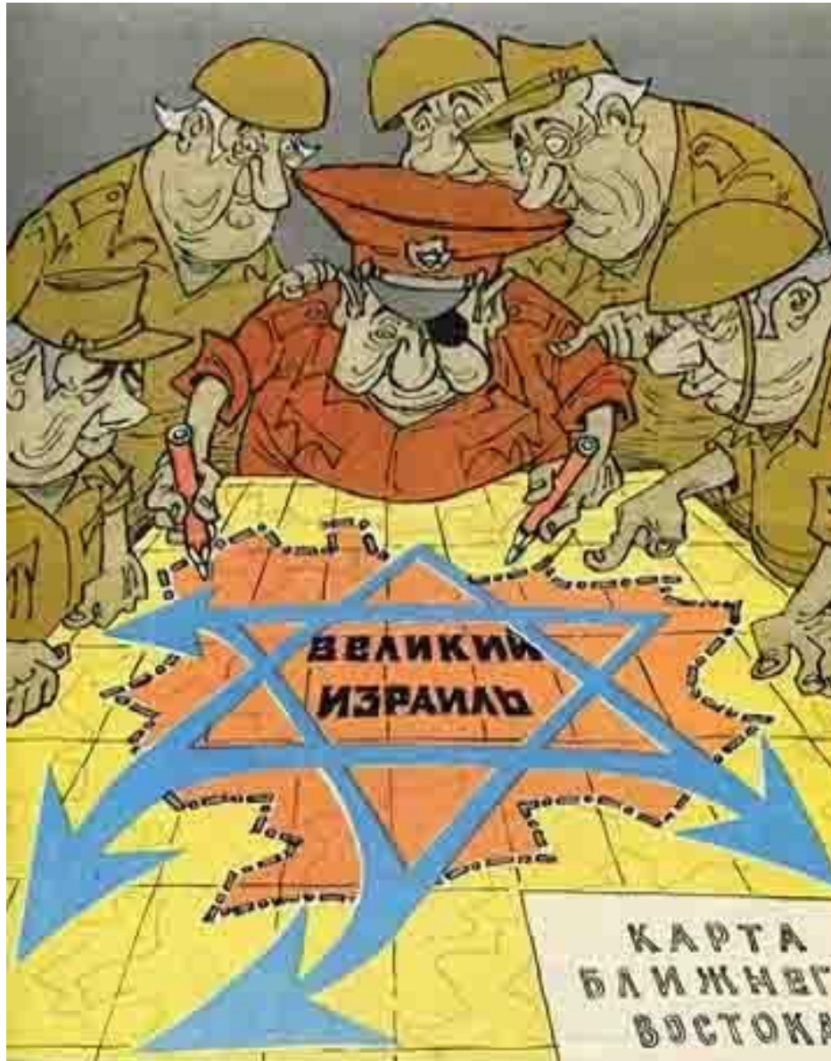
Huge Israel...The map of the Near East