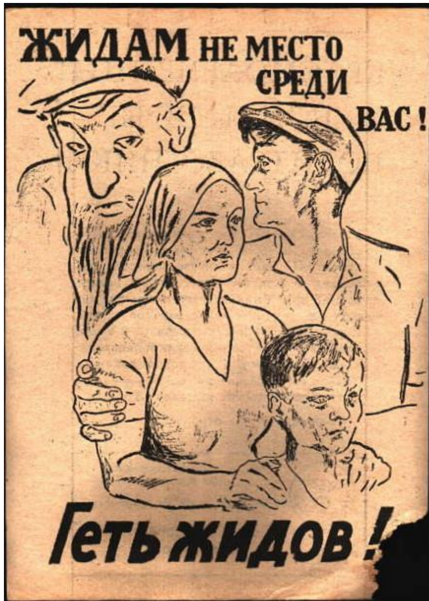
The Jews don't have a place amongst us! Banish the Jews!